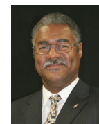
Julius C. Trimble Resident Bishop, Iowa Area The United Methodist Church

In addition to communicating the positions of The United Methodist Church to the Iowa General Assembly and to the U.S. Congress (Iowa delegation), the Social Justice & Mission Ministry works to inform Iowa United Methodists about current happenings in the state legislature and what citizens can do to make a difference. We truly are active participants in the search for justice of all of God’s people.