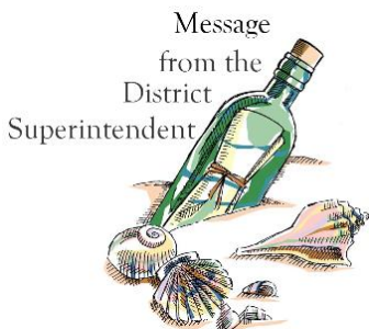
Message from the District Superintendent

I want to share my reflection on Matthew 6.