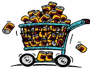
Angel Food Ministry

Angel Food Ministries is designed to put more food in people's pantry, refrigerator, and freezer for a significantly lower cost. Generally one medium box of food assists in feeding a family of four for about a week or a single senior citizen for almost a month. The food is the same high quality one could purchase at a grocery store. There are not second-hand items. No damaged, out-dated goods, or dented cans without labels. Nothing is day-old, or produce that is too ripe.