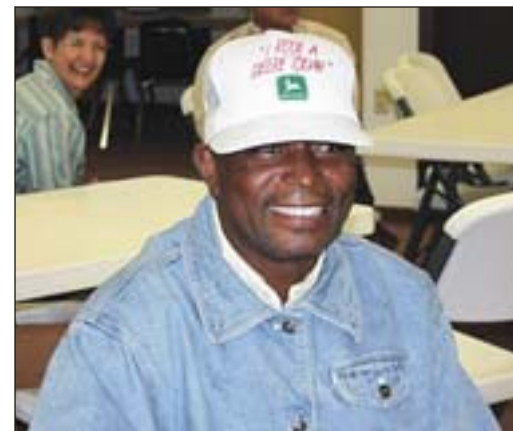
Nigerian missionary visit to Walker UMC