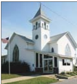
Walker UMC exterior

Struggling to meet their obligations, the congregation was well aware that their last remaining resource was a modest CD. If they cashed it in—there would no longer be a “safety